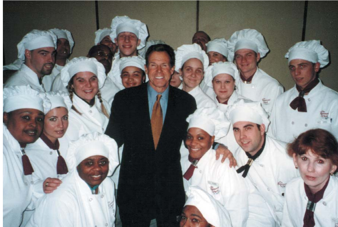
Chefs Galorie in Philadelphia

Black Tie International 25 24 Black Tie International